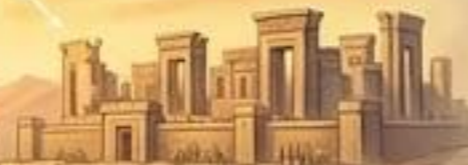
Susa, and Persepolis